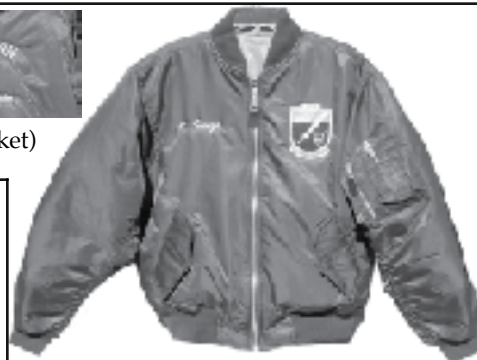
Item #7 Winter Jacket

The same ones that the Blue Angels wear. Very sharp looking with the back Embroidered. A Patch/Crest (or both) and your name can be added to the front for additional cost (see add on items.) Call before ordering.